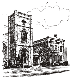
Cathedral Church of Saint Stephen and Cathedral House Harrisburg, PA