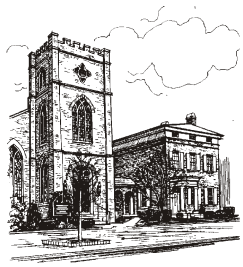
Cathedral Church of Saint Stephen and Cathedral House Harrisburg, PA