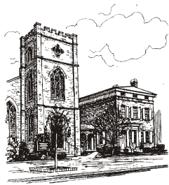
Cathedral Church of Saint Stephen and Cathedral House Harrisburg, PA